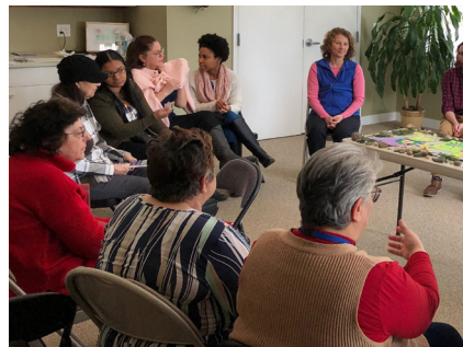
Patients from the Family Health Center of Worcester participate in art therapy (top) and group therapy (bottom) at a retreat on Feb. 28th hosted by the Healing Garden.